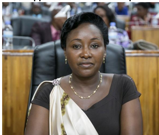
Ms. Soline Nyirahabimana, Rwandan Minister of Gender and Family Promotion.