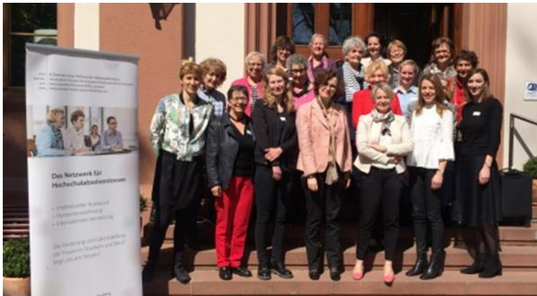
Members of the Swiss Association of University Women (SVA) during the 2017 “Women in STEM” training.

SVA provides its members with the opportunity to participate in an annual, training workshop focused on a theme related to the empowerment of all women and girls through safe and equal access to education. In 2017, the workshop’s theme was “Women and STEM”.