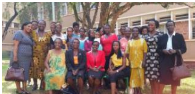
Convenor, volunteers and beneficiaries of the UAUW Gender Sensitisation of School Laboratory Technicians Project

In 2016, through the GWI BRPID programme, UAUW carried out a project for the gender sensitization of school