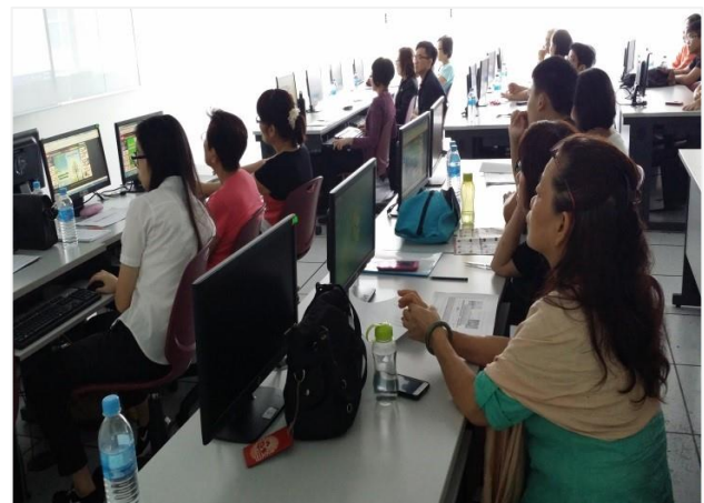
UWAS public Computer Skills and Knowledge course for Seniors

Concerned that elder women are often excluded from learning opportunities, UWAS created the first public Basic Computer Skills and Knowledge Course for seniors in the community. During this 4-part course, seniors are paired with a volunteer who teaches computer skills on a one-to-one basis. Due to popular demand, three additional rounds of basic computer skills class quickly followed the pilot round. A new Basic Facebook Skills Course has been created for participants who already possess basic computer skills.