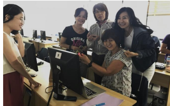
UWAS members during the 2018 UWAS Smart Workshop

The promotion of STEM knowledge for all is at the core of UWAS who organizes a variety of STEM-oriented projects for its members, nonmembers, seniors and inmates. In 2018, UWAS started a Smart Workshops Series to provide education to its members. The first of these workshops taught participants how to make a simple step tracker and digital game with an accelerometer using micro bits.