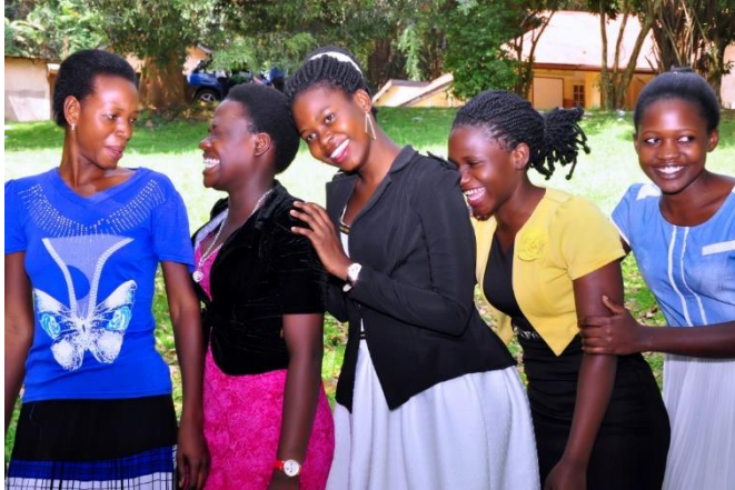
GWI Teachers for Rural Futures students.

laboratory technicians. The project trained laboratory technicians to exercise gender responsive methodologies to increase the likelihood of equal participation of girls and boys in laboratory activities. The project was initiated to sensitize a wider group of laboratory technicians at local and national levels, to boost girls' interest in laboratory practical work and to address the poor performance of girls in science related projects. The participants' experiences and findings of the projects were documented and shared with education stakeholders and other schools.