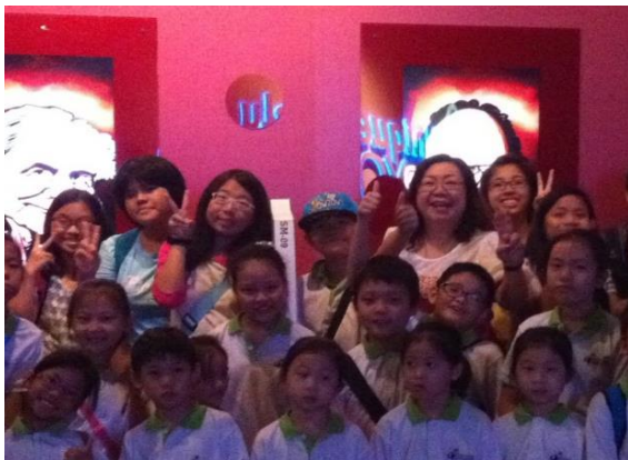
UWAS members and local school children during their participation to the Singapore Science Centre "Scientist for a Day" workshop

To encourage girls' interest in science, UWAS developed a Student Enrichment Platform (SEP) that leverages smart technologies for disadvantaged children from seven to 12 years of age to improve their knowledge in math and English. The pilot project was deployed at three primary schools in Singapore. UWAS also organized participation in the "Scientist for a Day" workshop held at the Singapore Science Centre where students learn about scientific methods through experiments such as static electricity and the Van de Graaff generator, convection demonstrator, optics demonstrator, Crooke's radiometer and microscopes.