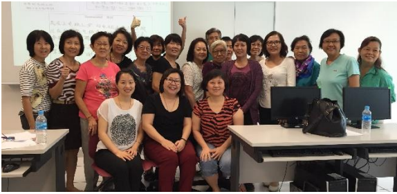
Convenors and volunteers of the UWAS Basic Computer Literacy Programme for soon to be released inmates

Noting that basic computer skills are key to daily life, UWAS developed a Basic Computer Literacy Programme for soon to-be-released inmates that equips them with the necessary computer skills to integrate in the society upon release. Each module consists of two sessions, with average attendance of 15 to 20 inmates who receive individual attention.